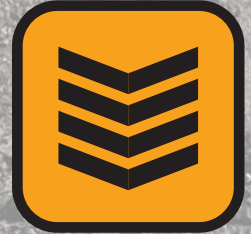
Military grade quality