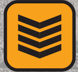
Military grade quality