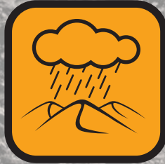
IP 65 Certified