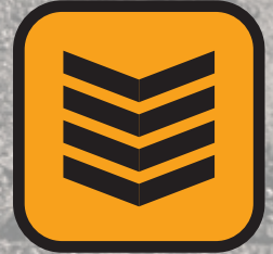
Military grade quality